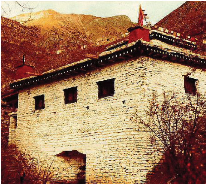
The "Temple Of Miraculous Fire" at Muktinath, Nepal. Photo by Ken Street (Nov. 1979).

[For more on this subject, please read our tract The Temple Of Miraculous Fire .]